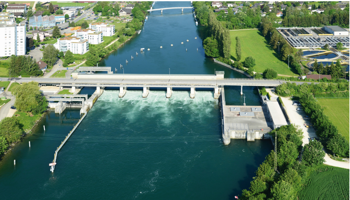
innovative automation technology at Port Brügg can now be used to provide greater protection for people and the local environment.